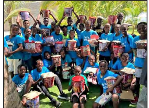
The kids were happy and thankful to have a gift to share with their moms.