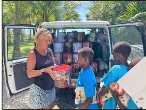
Distributing to the volleyball kids.