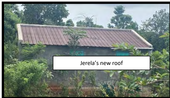
Jerela's new roof