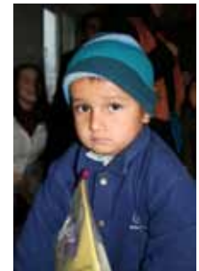
They were holding them so tightly; making sure that nobody could take it away.