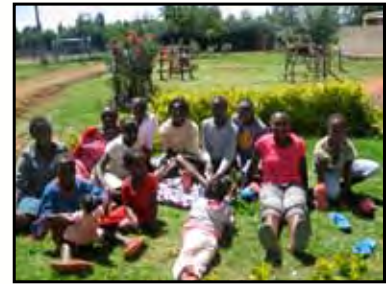
Enjoying School Break

Another great outcome of the mission trip is the “vision casting” that took place. We have always believed God would have us establish a high school in the village so the children of The Haven/Fresh Start home would not have to go away to boarding schools (and other local high school students could attend as well). That has not changed, but we now believe God would not have us to establish our own elementary school, but rather to come alongside the public school to raise the standard of education so the whole village can benefit, rather than withdrawing the orphans from the local school where they are obviously ‘salt and light’ in the community. Please pray for God to bring to fruition what he has placed in our hearts.