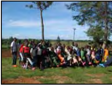
Croc shoes for Kids

The team also distributed Croc shoes to the orphans, offered First-Aid training, visited orphans and other children in a slum of Kitale town, participated in “purity talks” with the kids at the home, pursued a relationship with the headmaster of the kids’ primary school, met and initiated a relationship with the village chief, helped kids to write pen-pal letters and taught Sunday school at the local church on Easter Sunday. Perhaps some of the greatest ministry opportunities, however, took place in the ‘free time’ in which we simply spent time with the kids, showing them the love of Jesus by showing them we care.