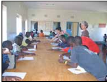
Pen Pal Project