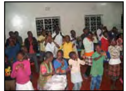
Celebrating Our Time Together

Another great outcome of the mission trip is the “vision casting” that took place. We have always believed God would have us establish a high school in the village so the children of The Haven/Fresh Start home would not have to go away to boarding schools (and other local high school students could attend as well). That has not changed, but we now believe God would not have us to establish our own elementary school, but rather to come alongside the public school to raise the standard of education so the whole village can benefit, rather than withdrawing the orphans from the local school where they are obviously ‘salt and light’ in the community. Please pray for God to bring to fruition what he has placed in our hearts.