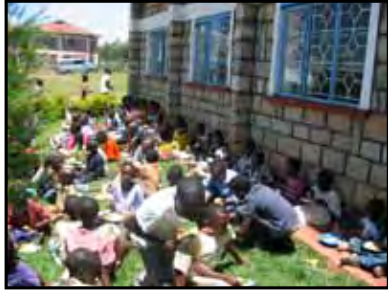
Good Neighbor Project

In April, a team of five folks from Memphis, TN paid a visit to the Haven/Fresh Start home in Jua Kali, Kenya. The children and adults of the home were found to be thriving and enjoying the break from school. All of the ministry objectives of the mission team were accomplished, relationships were enriched and God was glorified.