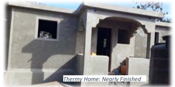
Thermly Home: Nearly Finished

Though we long to return to Haiti, we are delaying our travels due to the current unrest and to assist with a family member's recovery from a brain surgery. We hope to return after the New Year as a family, but if practicable, Austin will take a short trip in November to coordinate the construction of our cistern.