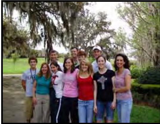
CENTER POINT CHURCH

"Three teams from Ocala recently invaded Haitian Territory"