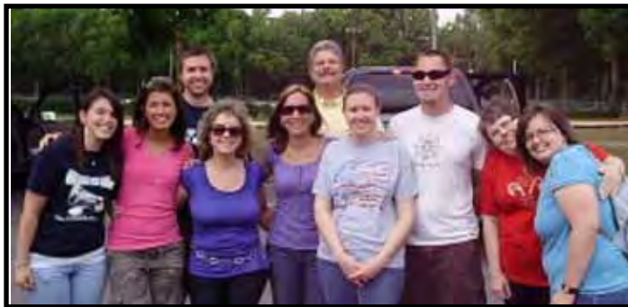
TRINITY BAPTIST CHURCH