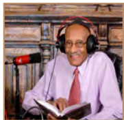
Audley McLean Radio Ministry