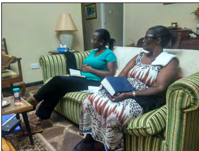
Discipleship class at our cottage