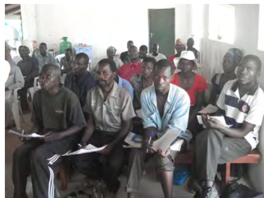
Working with Tonga Pastors in Zambezi Valley