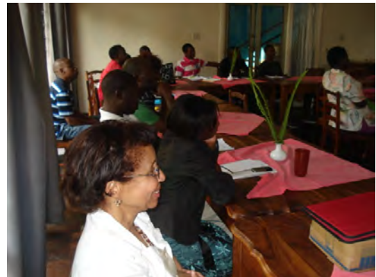
Seminar at Eternal Paths, Harare