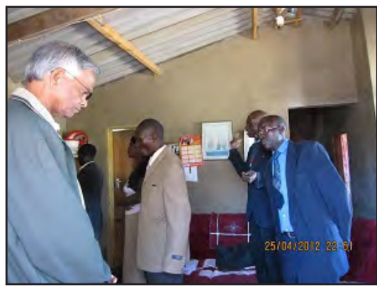
Class at a home in Gushure Village, Rusape