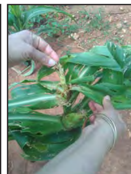
Army worm infested Maize