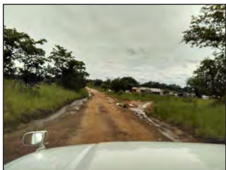
The road to Goromonzi