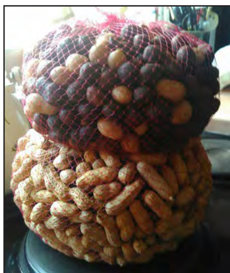
Nemo beans and peanuts. 3lbs for $1 at a roadside vendor