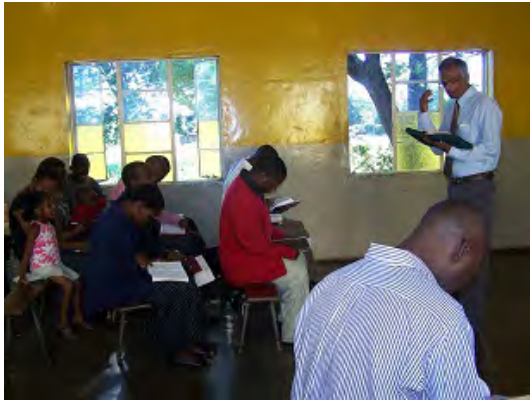
Ministering at Vineyard Church, Chinoyi