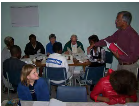
Teaching at Renewal Church, Harare