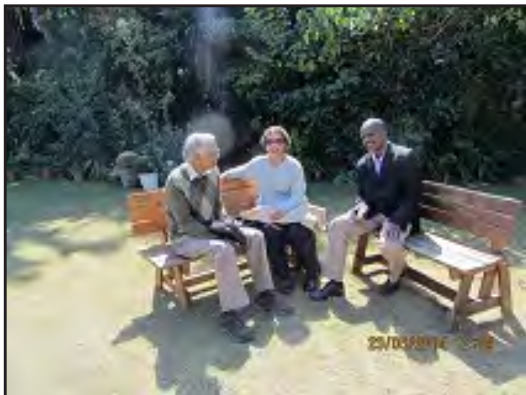
In Harare we do one on one discipleship